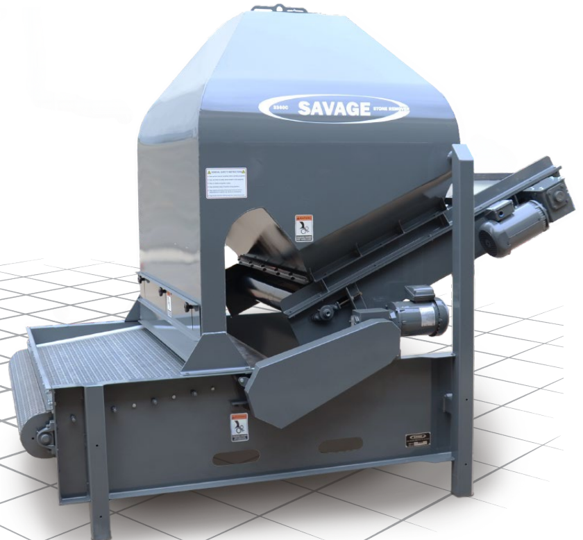
Stone Remover Model 3360C

S avage Equipment manufactures Aspirators and Stone Removers as part of our complete line of machines designed to efficiently clean your harvested nut crop. We call this equipment our Grayline, and we strive to make it the most effective and reliable machinery available.