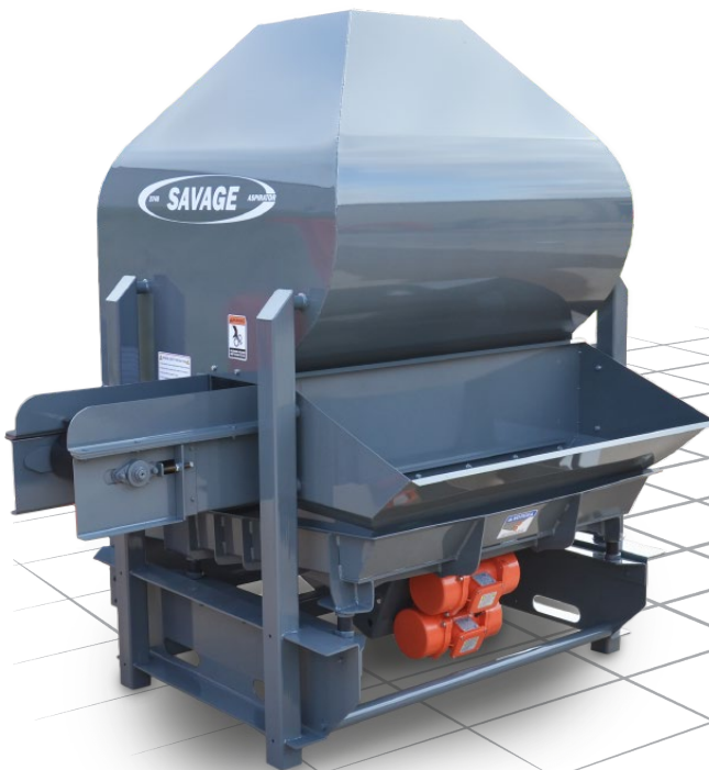
Aspirator Model 3748